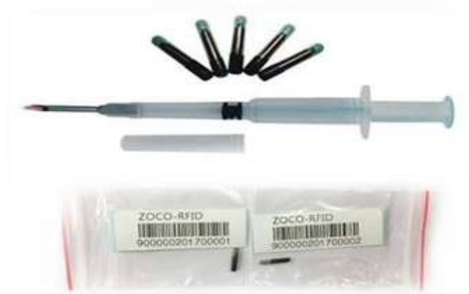
Fig: RFID INJECTOR

The Specification of RFID injector are Life time is 30 years above, Frequency of RFID injector is 134.2 kHz, Memory is 64 bits, Size of injector 12mm(length) & 2.12mm(diameter) and Material made by Bio glass & paralyne coated.