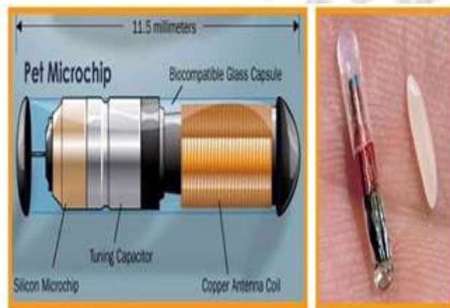
Fig: RFID Pet Microchip

Many types of RFID exist, but at the highest level, we can divide RFID devices into two classes: active and passive. Active tags require a power source—they're either connected to a powered infrastructure or use energy stored in an integrated battery. In the latter case, a tag's lifetime is limited by the stored energy, balanced against the number of read operations the device must undergo. One example of an active tag is the transponder attached to an aircraft that identifies its national origin. Passive RFID is of interest because the tags don't require batteries or maintenance. The tags also have an indefinite operational life and are small enough to fit into a practical adhesive label. A passive tag consists of three parts: an antenna, a semi-conductor chip attached to the antenna, and some form of encapsulation.