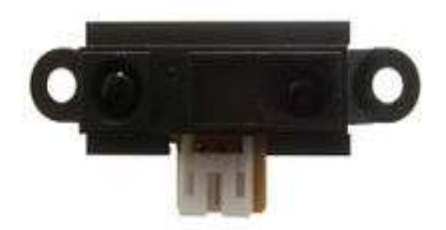
Fig. 4 Proximity sensor