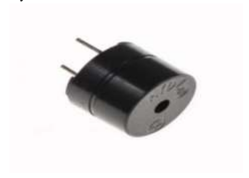
Fig. 6 Buzzer

A buzzer or beeper is an audio signaling device which may be mechanical, electromechanical, or piezoelectric. Typical uses of buzzers and beepers include alarm devices, timers, and confirmation of user input such as a mouse click or keystroke.