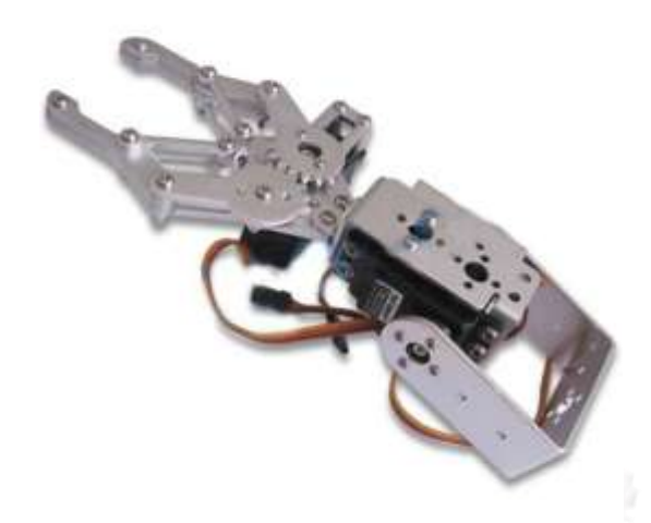
Fig. 7 Gripper

automation system. Many styles and sizes of grippers exist so that the correct model can be selected for the application. Compressed air is supplied to the cylinder of the gripper body forcing the piston up and down, which through a mechanical linkage, forces the gripper jaws open and closed. There are 3 primary motions of the gripper jaws; parallel, angular and toggle. These operating principals refer to the motion of the gripper jaws in relation to the gripper body.