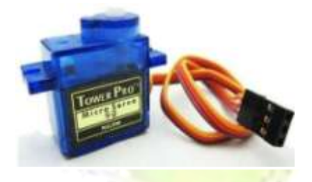
Fig. 5 Servo Motor

A servomotor is a rotary actuator or linear actuator that allows for precise control of angular or linear position, velocity and acceleration. It consists of a suitable motor coupled to a sensor for position feedback. It also requires a relatively sophisticated controller, often a dedicated module designed specifically for use with servomotors. Servomotors are not a specific class of motor although the term servomotor is often used to refer to a motor suitable for use in a closed-loop system. Servomotors are used in applications such as robotics, CNC machinery or automated manufacturing.