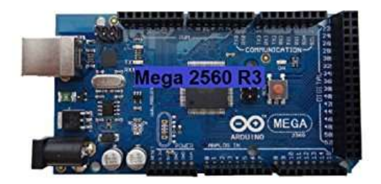
Fig. 2 ATMEGA 2560 Controller

operates between 4.5-5.5 volts. By executing powerful instructions in a single clock cycle, the device achieves a throughput approaching 1 MIPS per Hz balancing power consumption and processing speed.