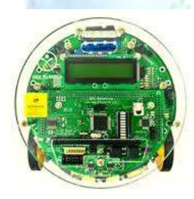
Fig.3 Fire Bird V

It contains Smart NiMH battery charger with power adaptor, Serial cable, SB cable, Flex printed 6 feet white lineUSB Programmer (ISP). Specifications of Fire bird V robot is Atmel ATMEGA2560 as Master microcontroller, Atmel ATMEGA8 as Slave microcontroller, 2 x 16 Characters LCD, Indicator LEDs, Buzzer, Eight analog IR proximity sensors, Three white line sensors